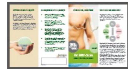
Information Flyer "HRV scan"

Whether HRV measurement (HRV-scan) or heart (HRV) biofeedback, the BioSign HRV technology used by doctors, psychologists, therapists, coaches and management trainers successfully.