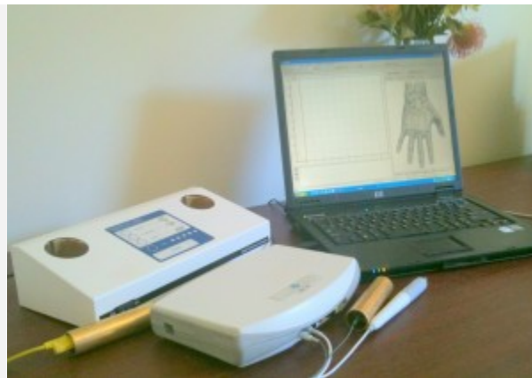
Latest SC-5 Upgrade Hardware

And yes there are a number of fraudulent instruments like the Avatar Health Screening System on the market.